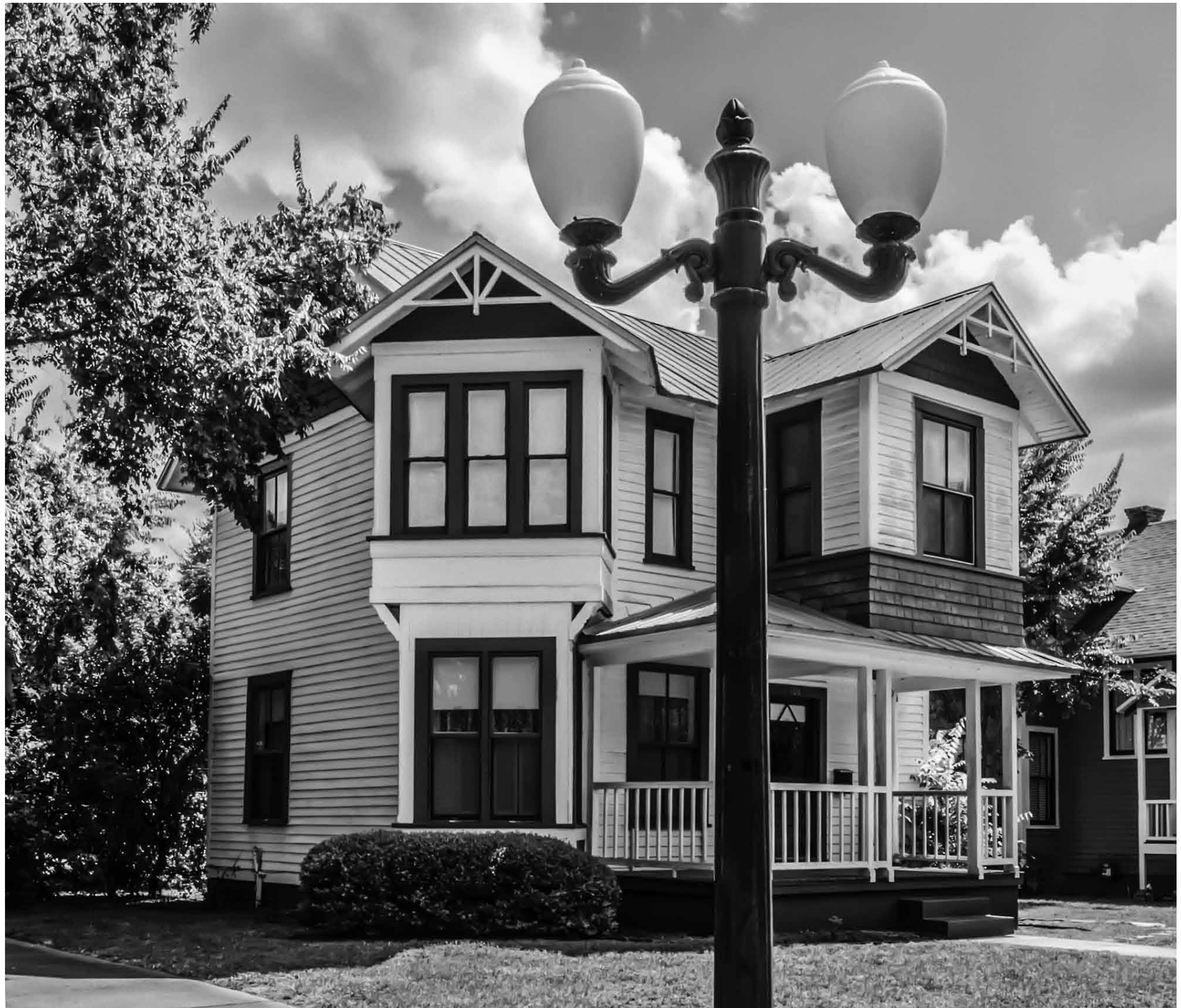
109 WEST 9TH STREET | MARY KENT