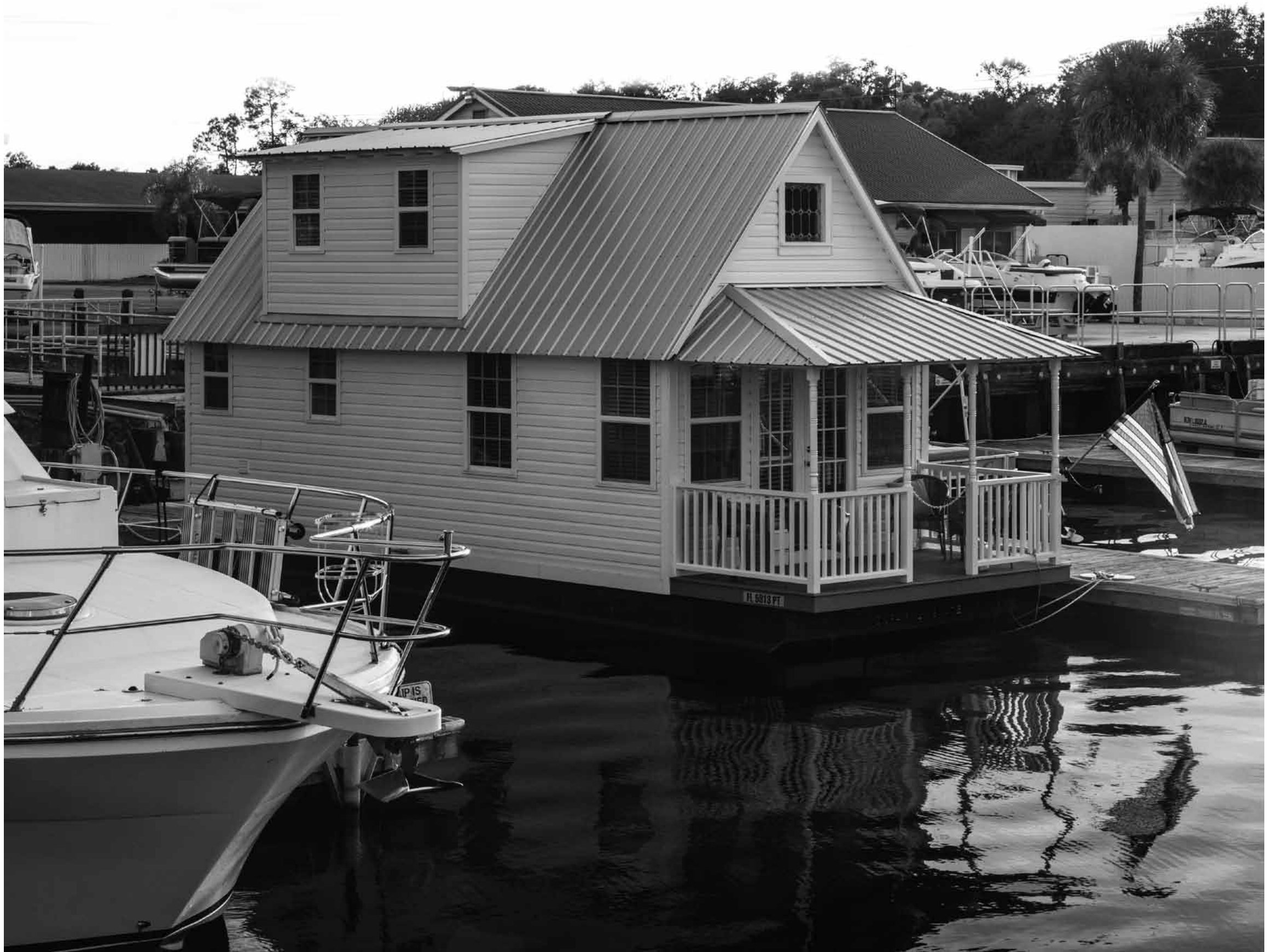
A DIFFERENT KIND OF SANFORD HOME LOCATED AT BOAT TREE MARINA | CYNTHIA BILLINGS