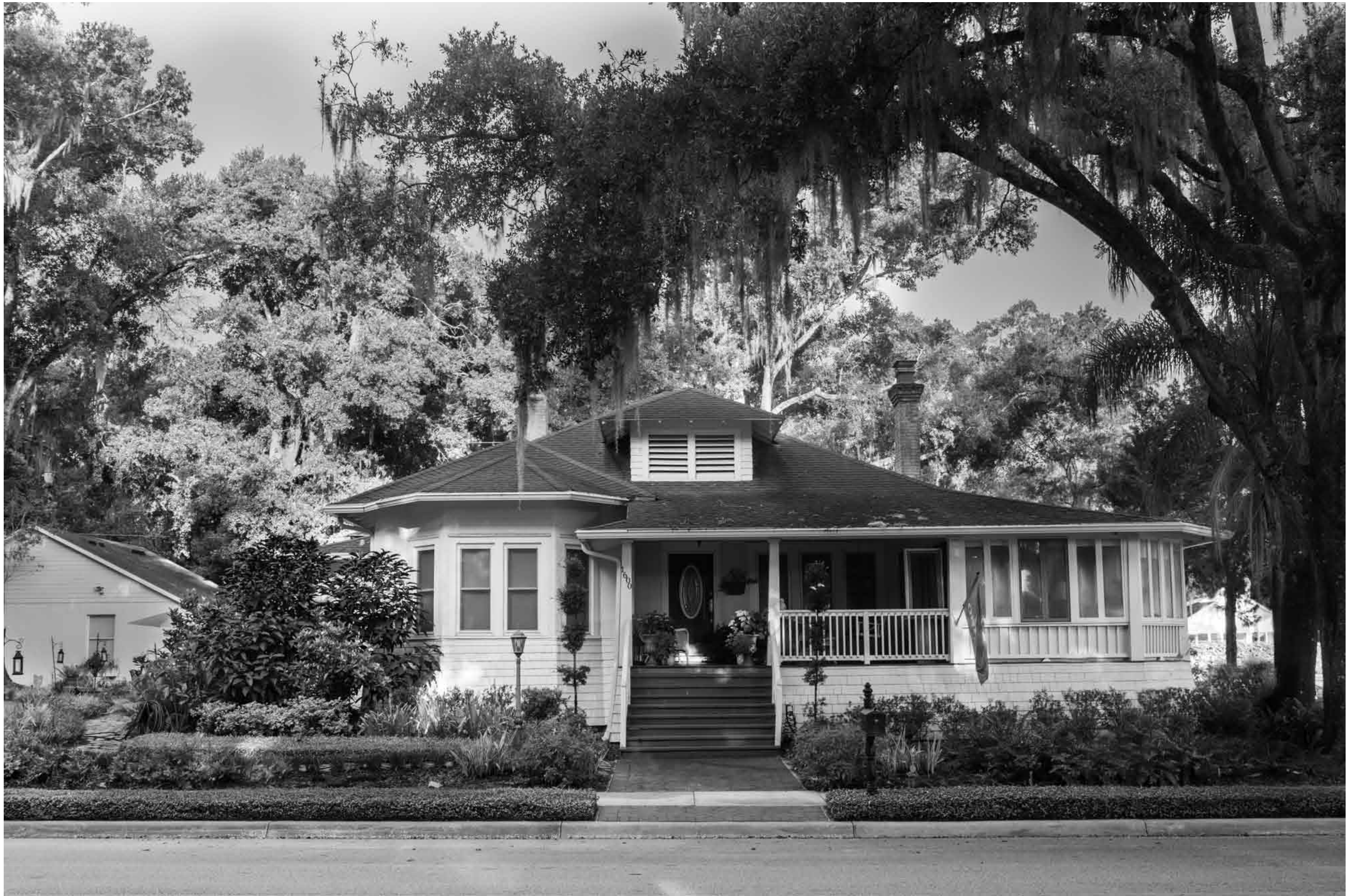
1600 SOUTH PARK AVENUE | ANTHONY DiPACE