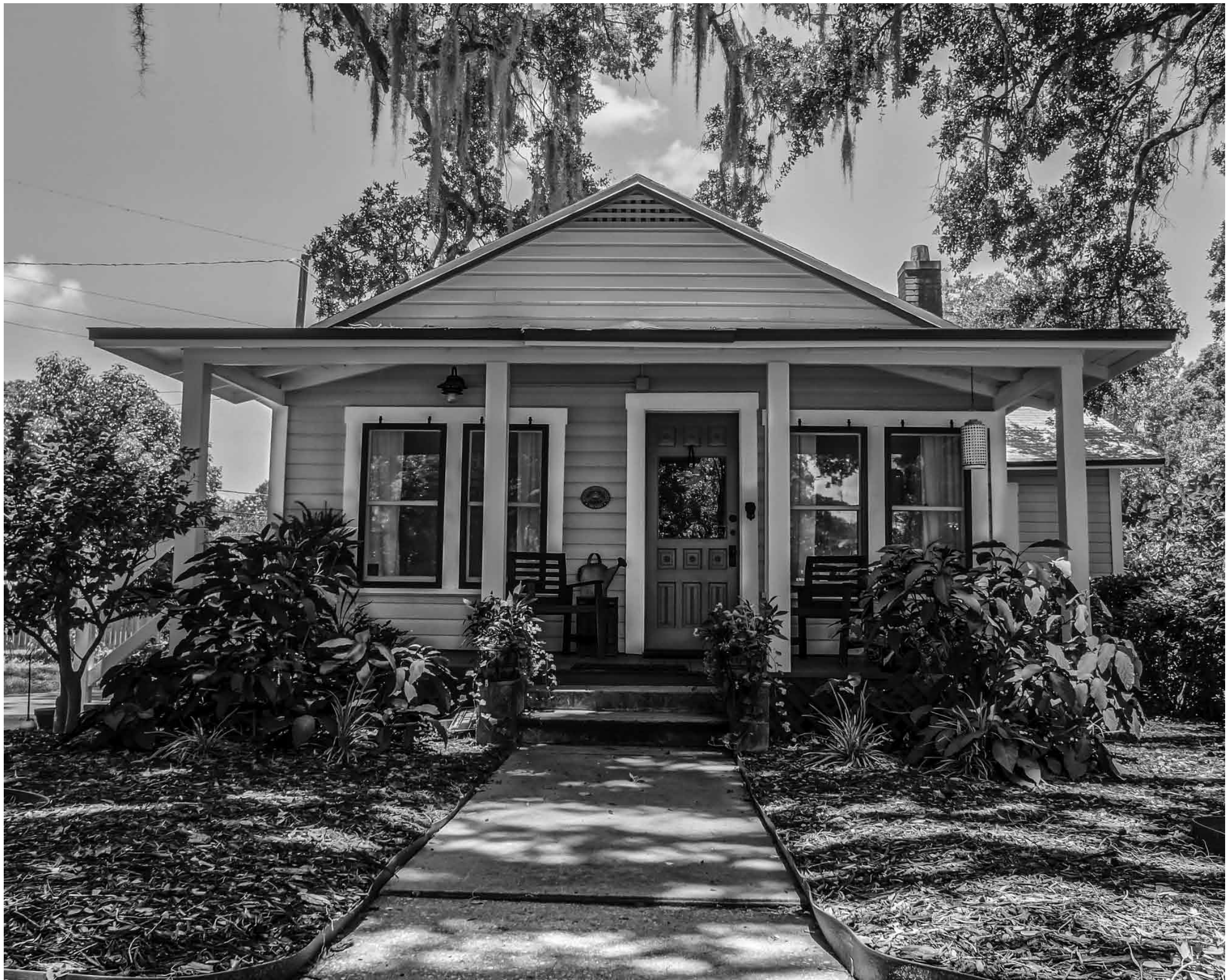
549 GLENDALE AVENUE | JOHN ALAVA