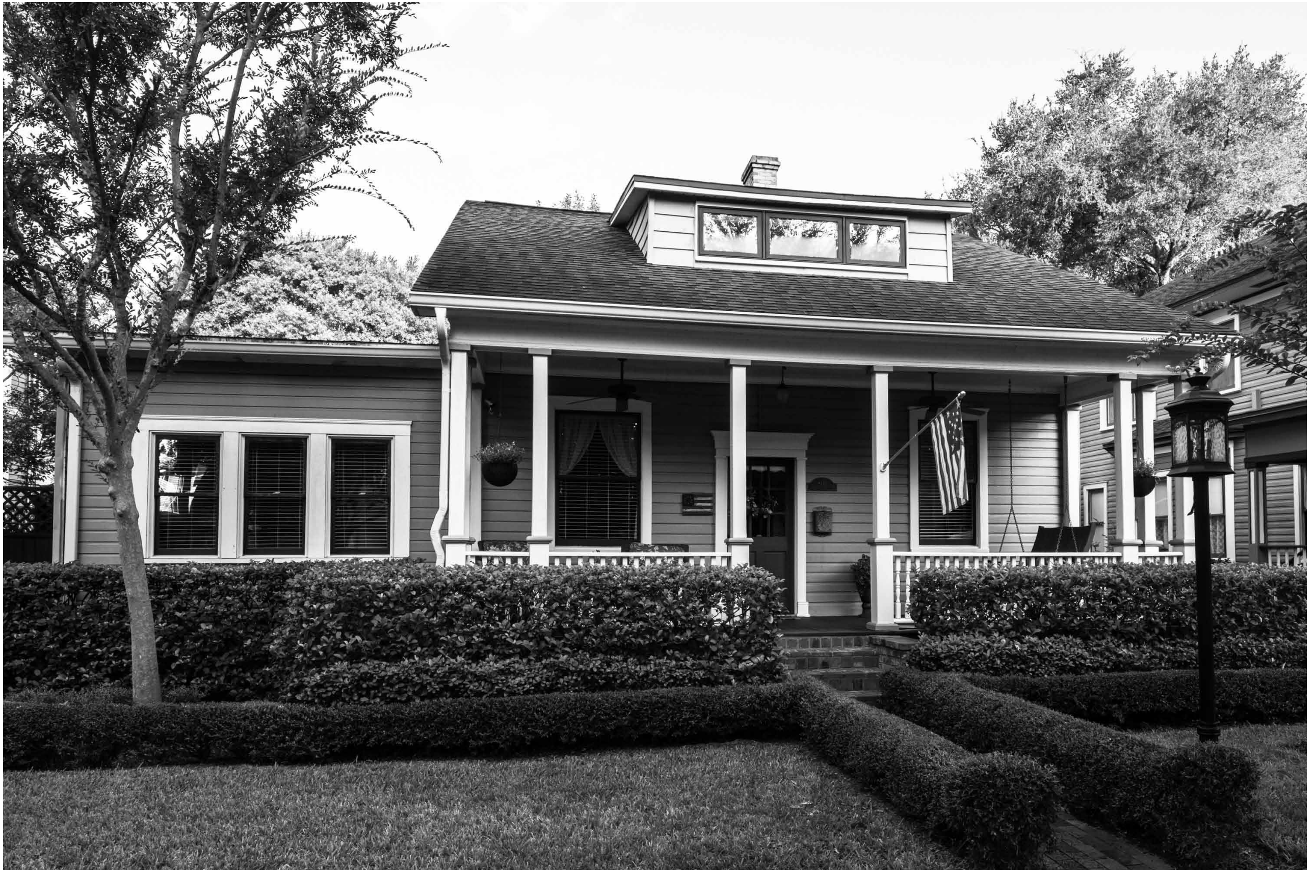
808 SOUTH MAGNOLIA AVENUE | JIM ERMISCH