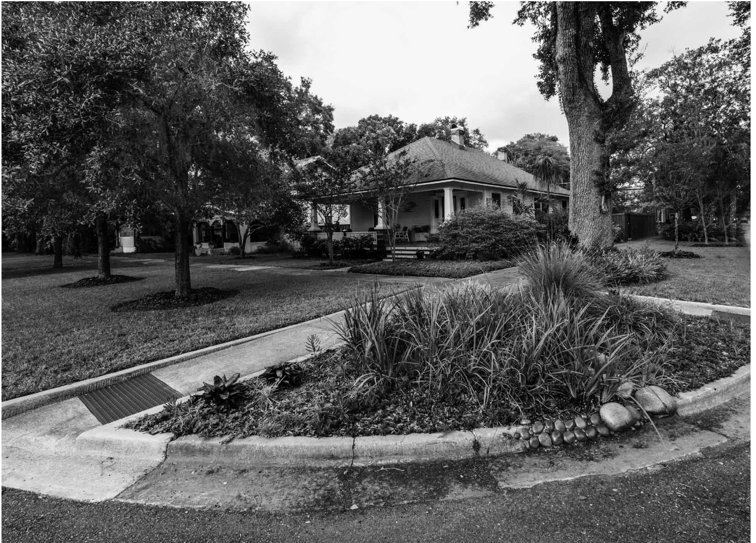
517 SOUTH MYRTLE AVENUE | JAY MACPHEE