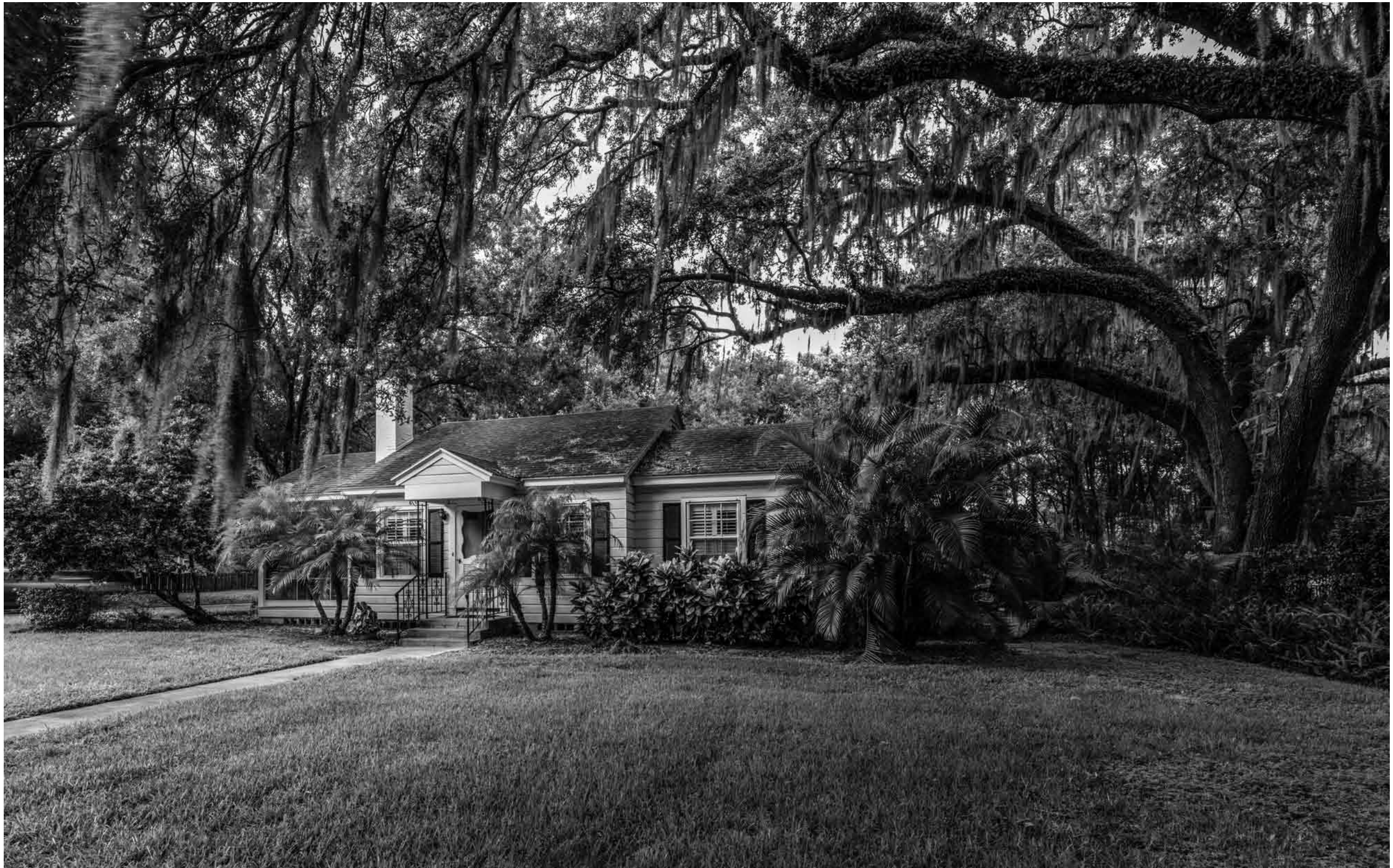
120 WEST 16TH STREET | REG GARNER