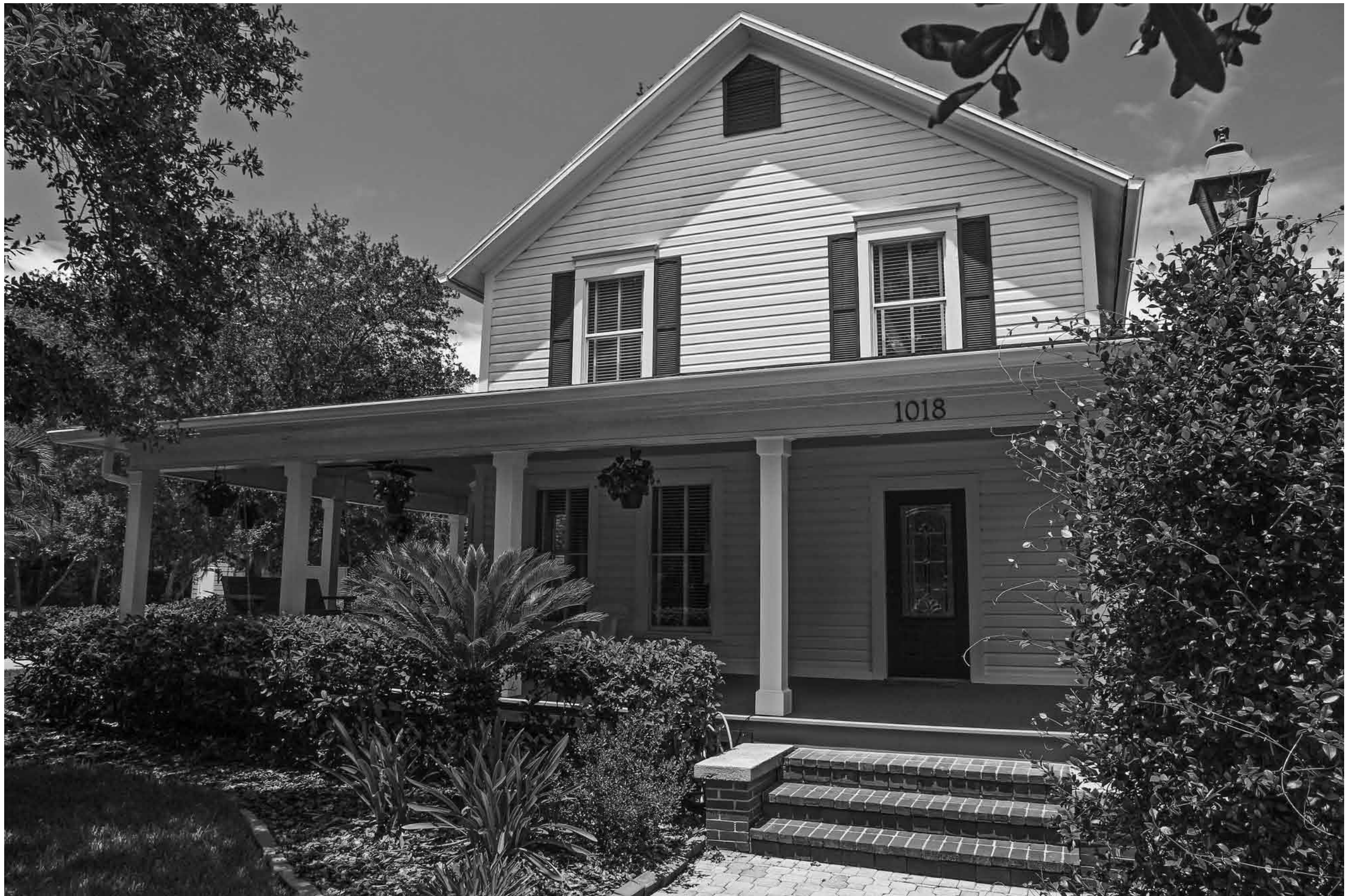
1018 SOUTH OAK AVENUE | BLAIK MATHEWS