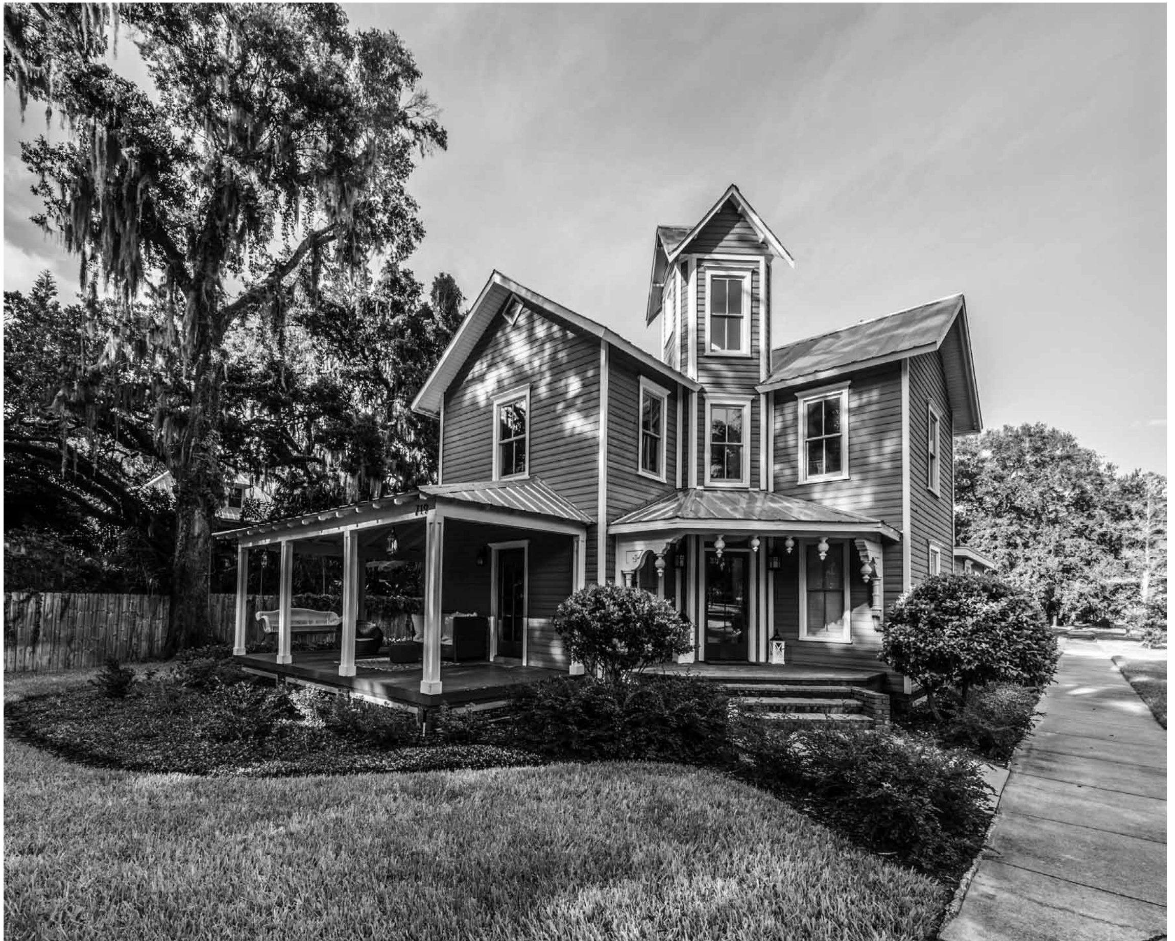
719 SOUTH OAK AVENUE | ROBERT CROSS