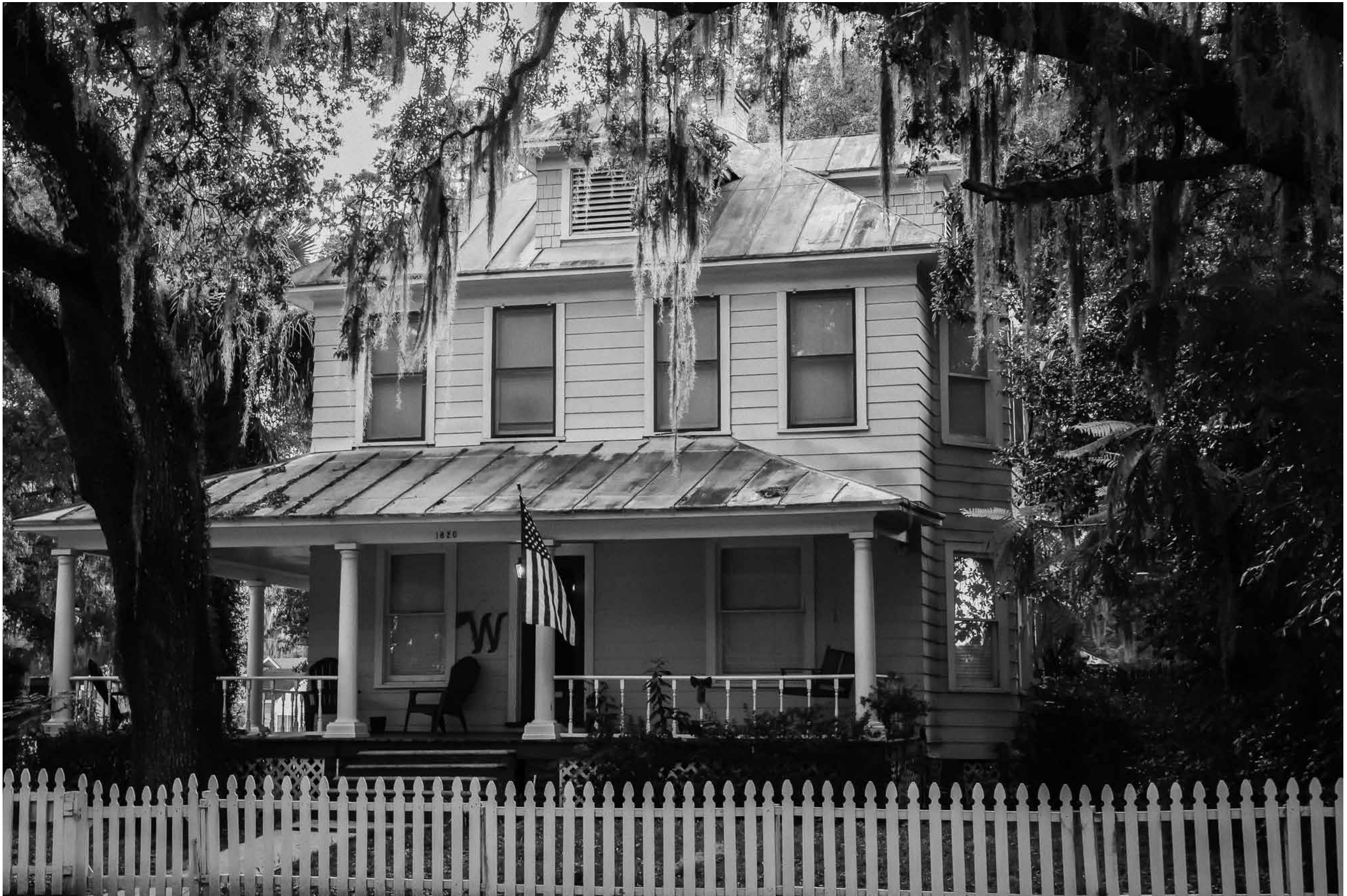
1820 SOUTH PARK AVENUE | CARSTEN BASILE